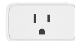
IQ Smart Plug SKU: IQIDP-PG