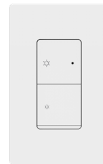
IQ Dimmer PG (3 way) SKU: IQDMR3W-PG