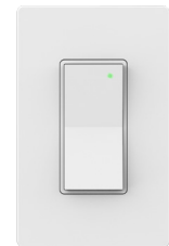
IQ Power Switch PG (3 way) SKU: IQSWH3W-PG